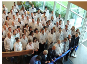
KEIHIN - MADISON COUNTY, IN

availability of skilled workforce, low cost of living, and a team fully dedicated to support you. Our success of over 3,300 new Jobs and $1.5 Billion Investment in the last 7 years is poised to continue as our team of 11 economic development professionals with strong multi-national experience promotes our Business Friendly community. With an extremely competitive incentive plan, Madison County helps companies with their initial investment as well as incentives for training your workforce, further investments, and additional help to succeed in the market.