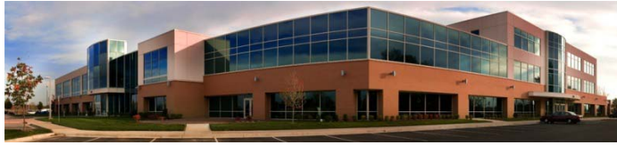
FLAGSHIP ENTERPRISE CENTER – MADISON COUNTY, IN

research and development. The Flagship Industrial Park is currently home to companies such as Echo Automotive, an electric vehicle component manufacturer, Greenville Technology Inc. (GTI), a Tier 1 advanced automotive parts manufacturer, and Keihin North America, a Tier 1 advanced automotive parts manufacturer's North American Headquarters and Engineering Center.