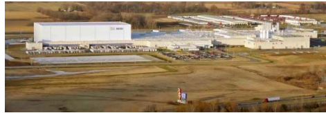
NESTLE - MADISON COUNTY, IN

Companies such as Nestlé from Switzerland, HDP from Israel,